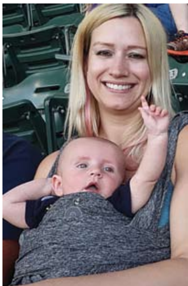
A HOPE Network member enjoys one of the Brewers games last summer

We offer women who are raising children alone -in Milwaukee and surrounding areas- connections, resources, and opportunities to build self-reliance and strong families.