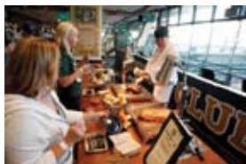
Club level dining

Two outdoor club level tickets for Packers vs. Dolphins on Nov. 11. A $100 gas card will get you there. Total value: More than $900!