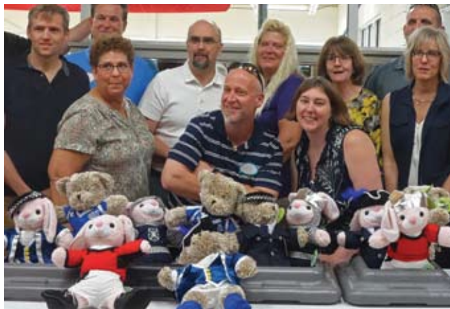
Alto-Shaam had a team- and bear! - building workshop in June. The company's project netted 15 new cuddly buddies for big brothers and sisters whose mamas receive a portable crib from HOPE's office. Many thanks to Alto-Shaam for teaming up with HOPE!

Fresh Picks Mobile Market in Milw. County: A grocery store on wheels. Along with other staples, it offers fresh fruits, vegetables and high-demand meat & dairy items. The market does not sell canned items or processed foods. Save 25% over prices at Pick 'n Save stores. Accepts debit or credit cards; Quest EBT (not cash). See schedule at: www.picknsave.com/mobilemarket or call 2-1-1.