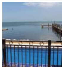
View from porch: Swimming pool, dock, and Gulf.

Spend a week at Casa Agua, a spacious vacation rental on secluded Grassy Key, mid-way between Key Largo and Key West. This 3 bed 2 bath home boasts accommodations for 6! Includes one-week stay, $500 airline money, $100 in local gift cards. More than $5,000 total value! More photos and details at: https://bit.ly/2nTkInu