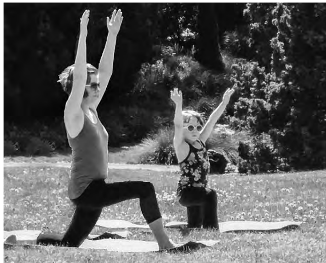
Family yoga at Boerner in 2017

Retzer Rangers , ages 5-7 w/adult, 4:30-5:30pm; arrive no later than 4:20pm. April 9 Spring Fever: hike, then make a flower collage. May 7 Down in the Dirt: explore, then plant something to take home. June 11 Shaping Wisconsin: learn about glaciers that formed WI landscape & hike to search for these features.