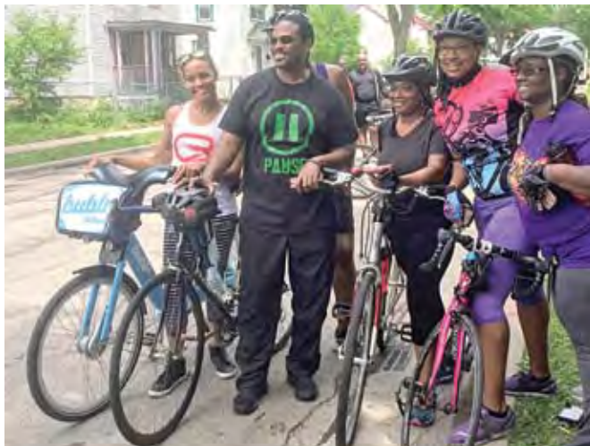
The first Promise Zone Bike Ride in 2017 went through some of Milwaukee's historical and industrial areas, connecting residents and launching the Promise Zone's efforts to affect positive change.

If you have an annual membership to Betty Brinn Children's Museum (or the other sites listed below), you can visit other museums for free on Swap Day, May 6. Go to the Charles Allis Art Museum, Grohmann Museum, Milwaukee Art Museum, Milwaukee Public Museum, Villa Terrace Art Museum or Pabst Mansion. (Discovery World is not included.)