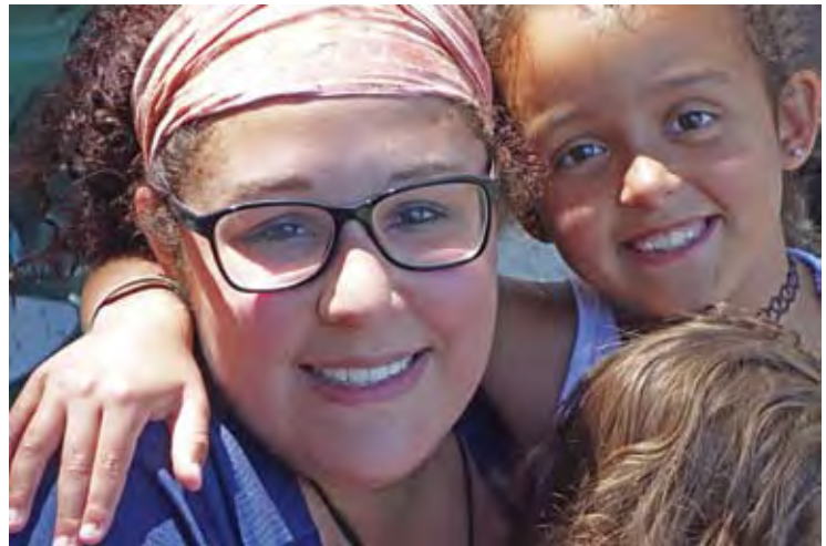
We're all looking forward to spring, and the baseball season! A HOPE Network mother enjoys a game at Miller Park last year with her children, thanks to free tickets to HOPE from the Brewers Buddies

Exposure to lead is especially harmful to children under the age of 6 because their bodies absorb more lead than adults, and their brains and nervous systems are more sensitive to the damaging effects of lead. Pregnant and breastfeeding women, or women of childbearing ages (15-45 years), should be aware of lead hazards in order to prevent exposure to a developing baby.