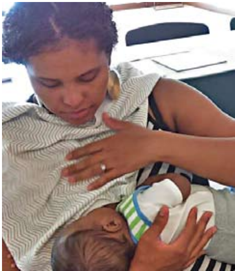
Mom and baby at a gathering of the African American Breastfeeding Network

Held twice a month. Pregnant women, breastfeeding moms, and their families attend for support, education, networking, and encouragement.