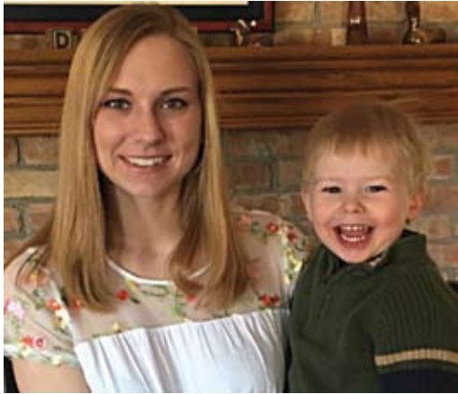
Every issue features profiles of our scholarship winners.