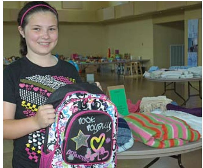
During the 15-year run of the Northwest Trading Post, children and their parents received so many needed items. There were more than 8,000 family visits recorded.